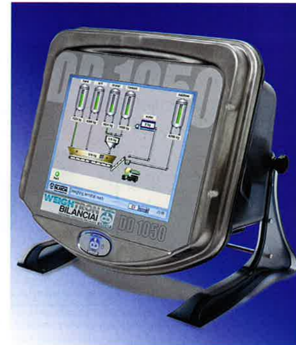
The DD1050 (above)

The input-output options include analogue and digital configurations (including pulse inputs), whilst the range of connectivity options ensure seamless integration for small or large systems alike. For added performance, Weightron's Winweigh IV software package integrates perfectly with the Diade philosophy to offer the ultimate in versatility, especially for multiple site operations.